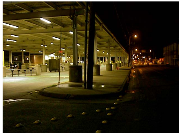
Light, Where You Need It When You Need It.!