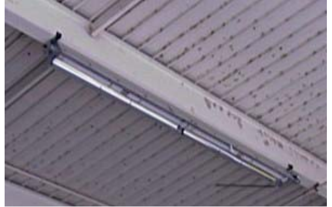
Clean, Neat Contractor Install