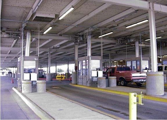
“Only Needed” Lights On