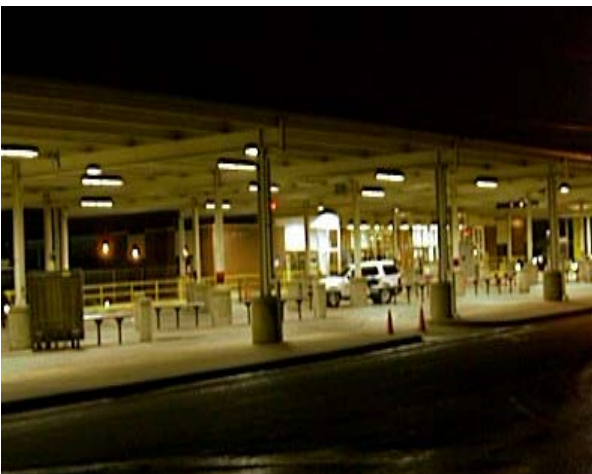
Note Very Little Light Outside Canopy